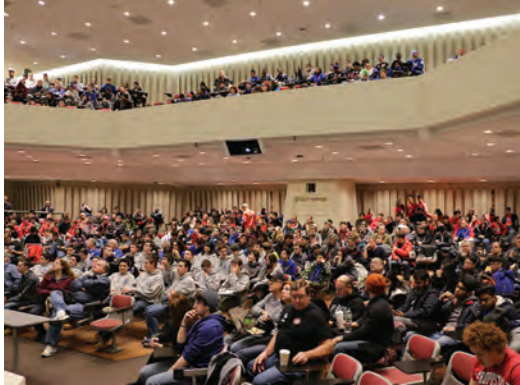
Forty-eight FIRST Robotics Competition teams waited for the reveal of the FIRST STEAMWORKS<sup>SM</sup> game.

Hundreds of FIRST Long Island students, educators and parents braved the impending snow and wind that threatened Long Island on Saturday, January 7, to attend the SBPLI Long Island Regional Kick-Off event at the Stony Brook University Jacob Javits Lecture Center. During the event, the participating teams also celebrated the unveiling of the 2017 FIRST Robotics Competition theme, "STEAMWORKS™," and picked up their associated kits of robot parts. Described by FIRST as a competition that "invites two adventurers' clubs, in an era where steam power reigns, to prepare their airships for a long-distance race," FIRST