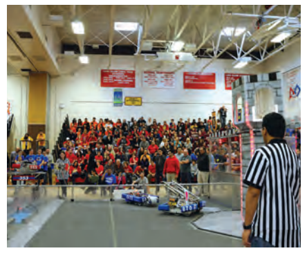
Robots from FIRST Robotics Teams #870 and one final time before #6423 score points by launching "boulders" at launching into the next the opposing alliance's castle tower. build season.

Hills High School West in Dix Hills, is a way for teams to face off using the previous season's robots