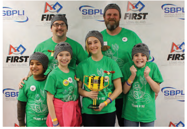
Members of FLL Team #92 the "Sea Lions" of Seaford accept the Champion's Award at the SBPLI FIRST LEGO League Championship Tournament.

Like with the other FIRST programs, teams are made up of students, coaches and mentors who all work together to develop a strategy and build robots based on sound engineering principles. In each round of the tournament, awards are given for the competition as well as for community outreach, design and other real-world accomplishments. The ultimate goal of FIRST Tech Challenge is to reach more young people at a lower cost, furthering the opportunities for accessible STEM (science, technology, engineering and mathematics) education to everyone.