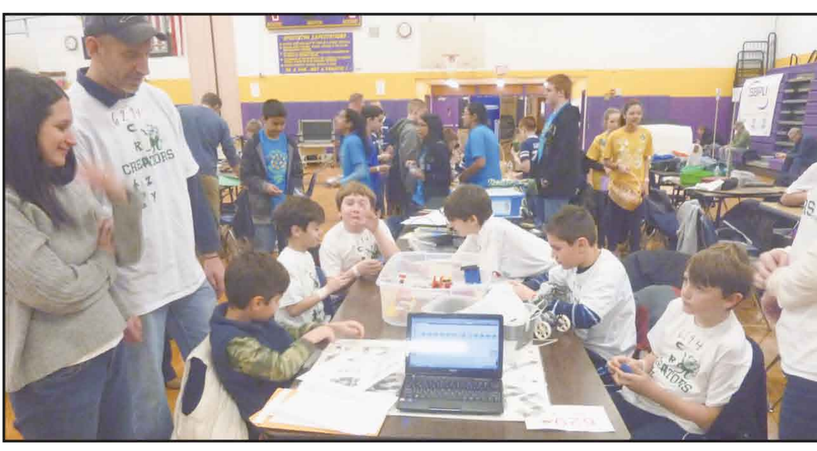
The Crazy Creators prepare their robots for the team challenges in the Central Islip Senior High School gymnasium.