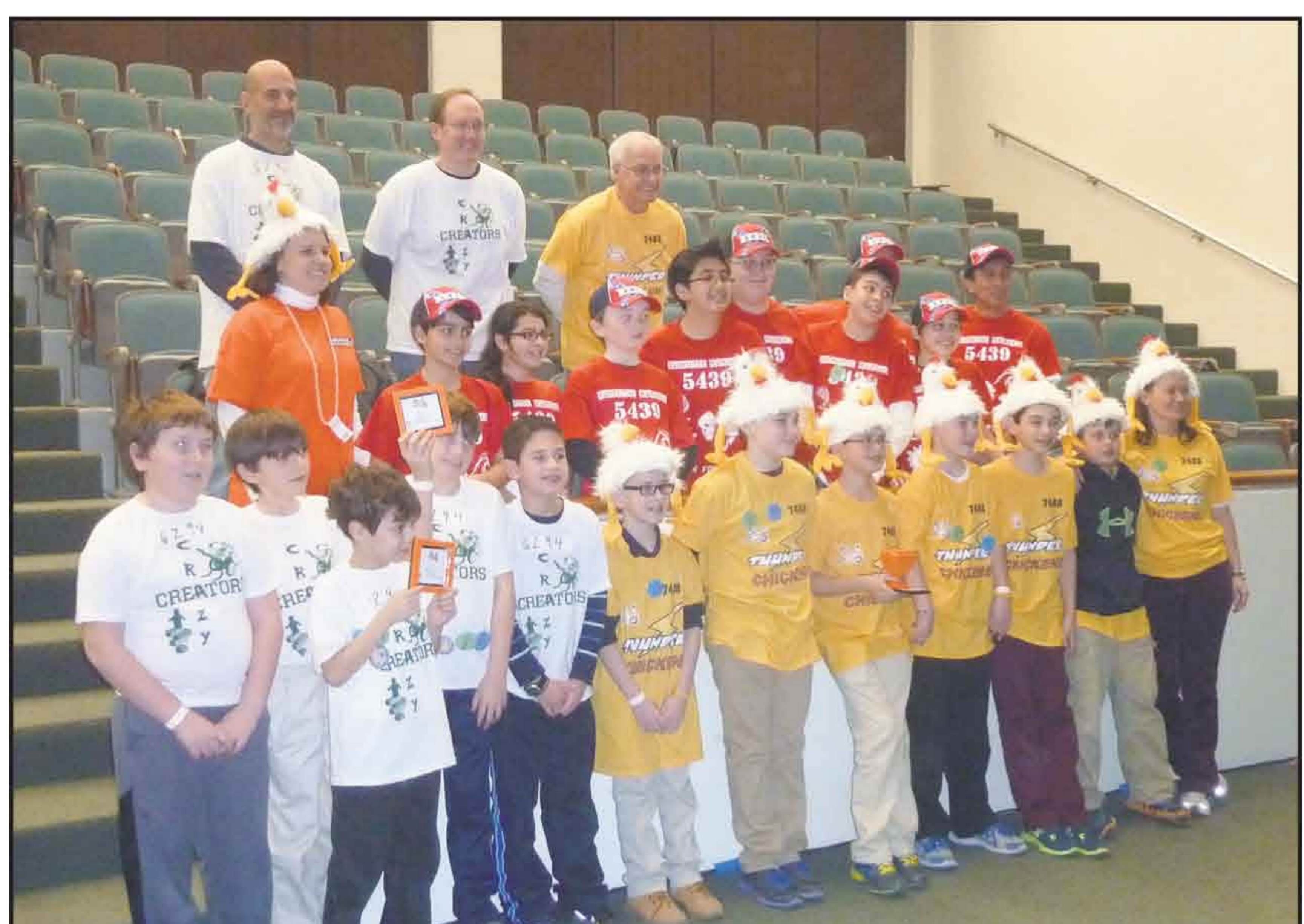
The Garden City teams celebrate a successful run at the FLL Qualifying tournaments.