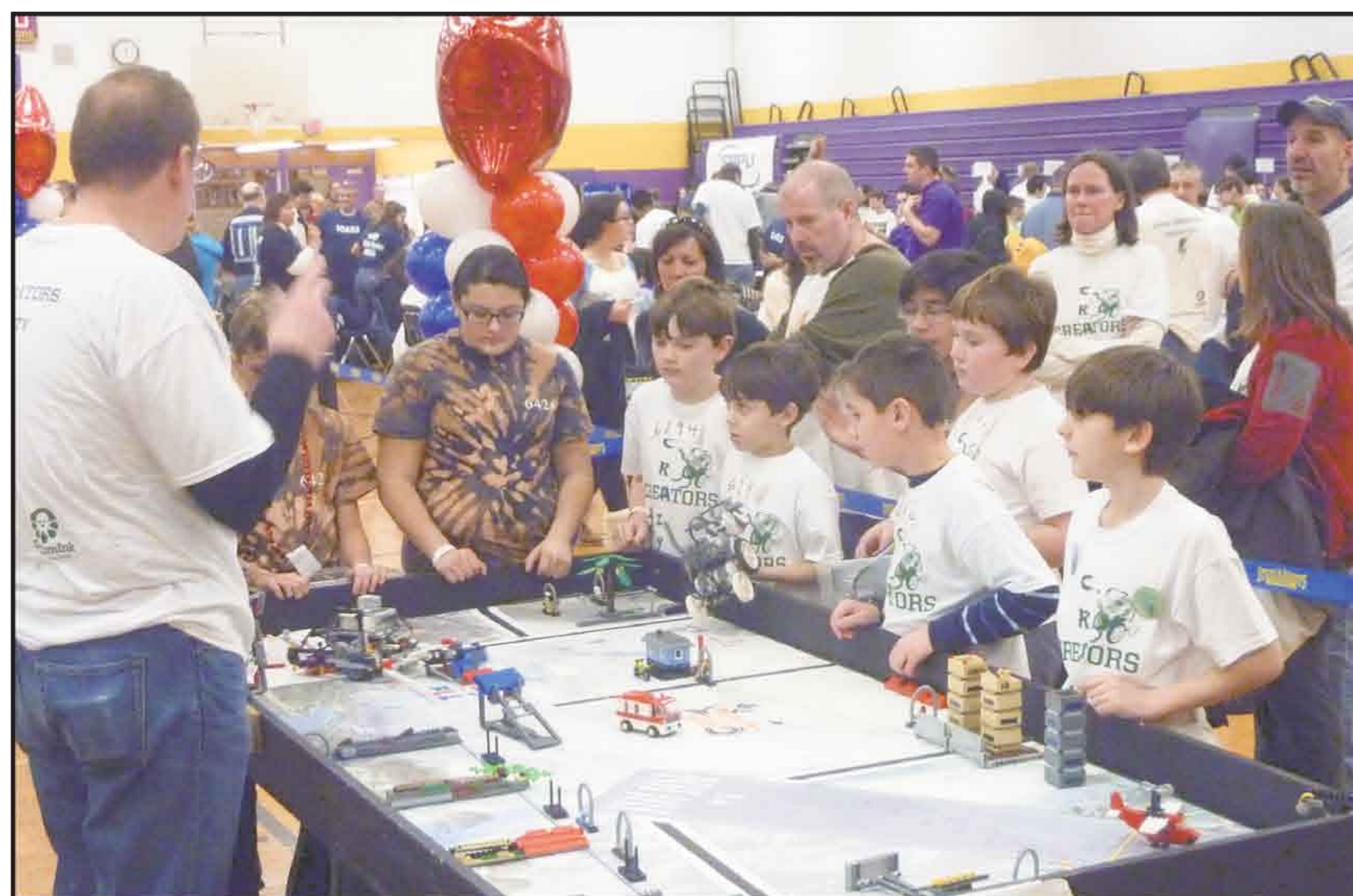
The Crazy Creators worked with the Bluepoint Robo Phantoms on a new 'Alliance' team competition this year.

The Crazy Creators brought their invention and robot to Central Islip Senior High School, site of this year's FLL Qualifying tournament, where 109 teams competed from across Long Island. In the robot game, teams operated their Lego NXT Robots in several matches against each other in the school's gymnasium. Divided into groups of two, they raced the clock to complete several tasks in two-and-a-half minutes, on tables containing the obstacle course. Points were awarded based on Lego pieces used for the project (no outside materials are allowed) as well as the successful completion of several pre-assigned